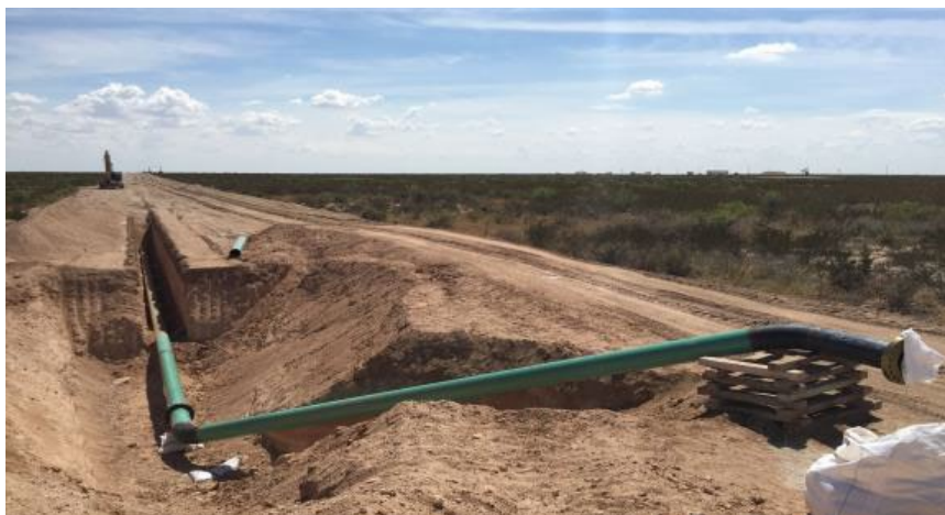
12", 24" and 30" Gathering Systems are also underway to tie in various regions of the Southern Delaware to the Caymus system.