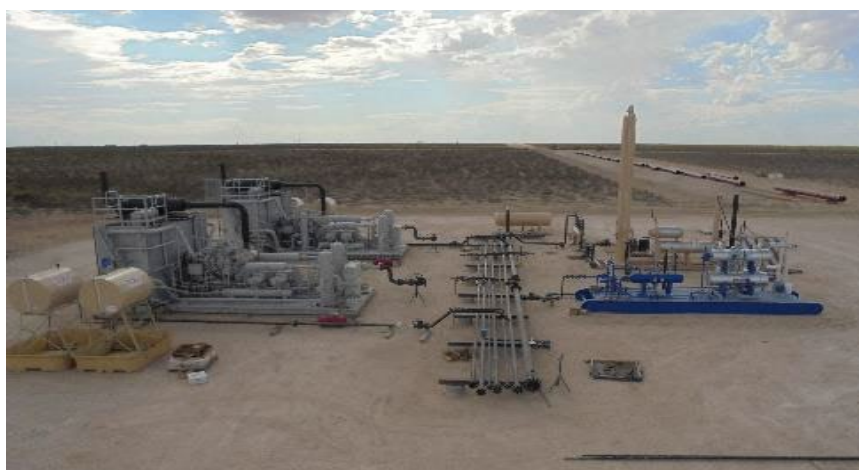
Producer CDP under construction for short-term solution in Reeves County.