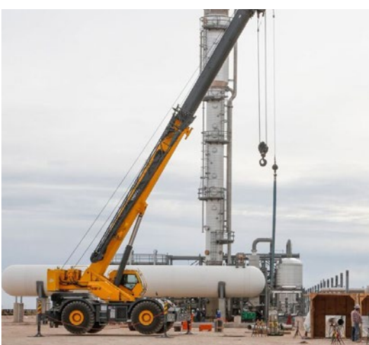
Demethanizer and Turbo Expander Installed