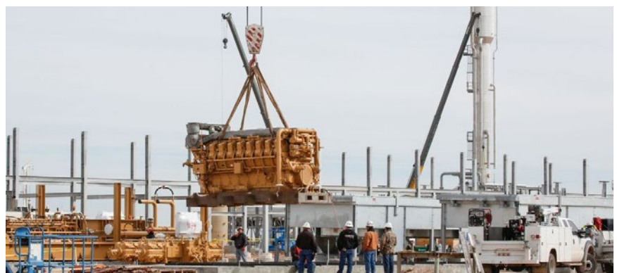
Caterpillar 3616 TALE Engine Ready to be Mounted on Skid