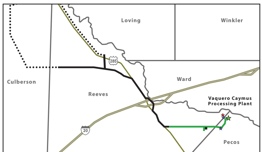
Vaquero Current Construction Footprint

Monahans Office 323 Private Road 42 Monahans, TX