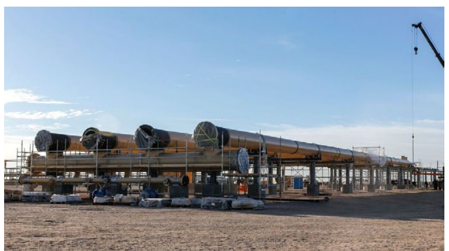
42" Multi Barrel Slug Catcher Underway