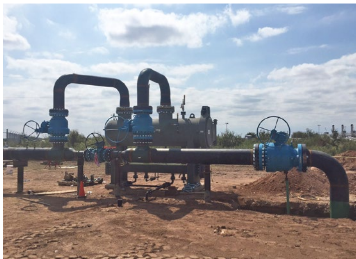
The 200 MMCFD measuring station and interconnect with Atmos Pipeline – TX is complete. First gas sales are expected on November 1st.