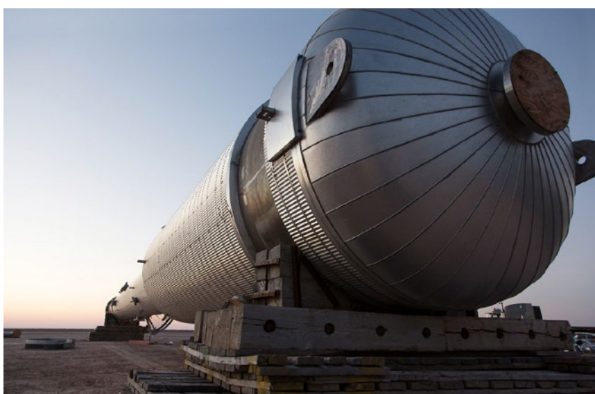
Delivery of new cryo unit began in early October