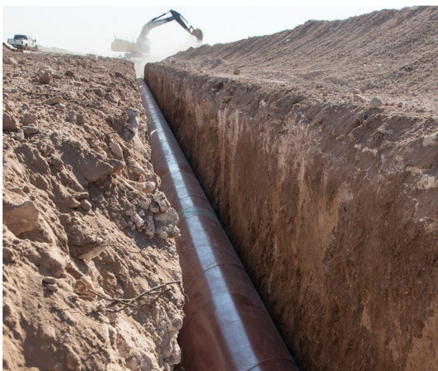
30" Lariat gathering pipeline