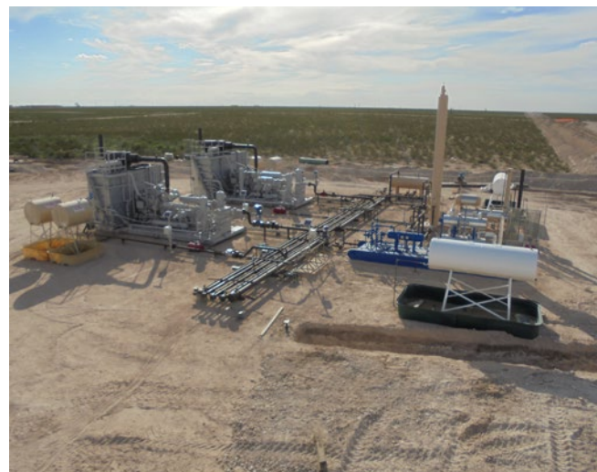
Interim processing solution for producer. First flow expected November 1st.